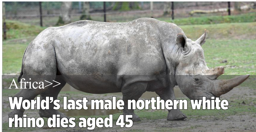
Africa>> World's last male northern white rhino dies aged 45