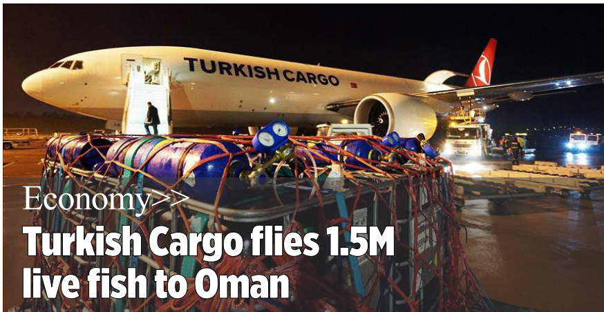
Economy>> Turkish Cargo flies 1.5M live fish to Oman