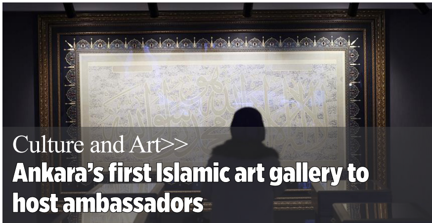
Culture and Art>> Ankara's first Islamic art gallery to host ambassadors