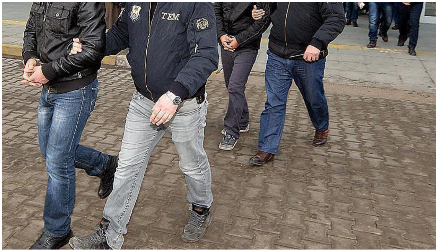
By Harun Kaymaz

Suspects are suspended teachers, according to security source