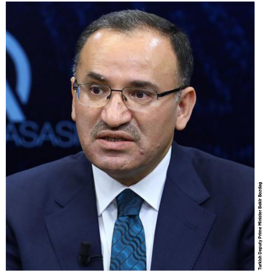
Turkish Deputy Prime Minister Bekir Bozdag

The deputy premier said Turks will open a "new period" on June 24 through the planned early elections. "We decided to move the elections to an earlier date to prevent Turkey from getting harmed," he said, adding that this would also end debates about the elections in the country. "The scenario in Turkey will be written by Turkish people, not by others anymore; everyone will be liable to the scenario written by the people." Bozdag also said President Recep Tayyip... MORE DETAILS