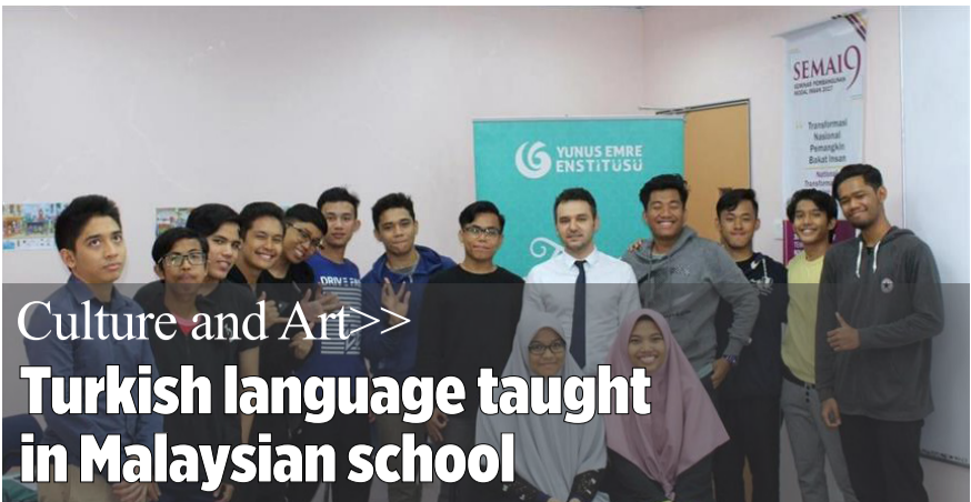
Culture and Art>> Turkish language taught in Malaysian school