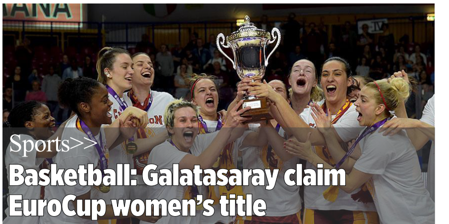
Sports>> Basketball: Galatasaray claim EuroCup women's title