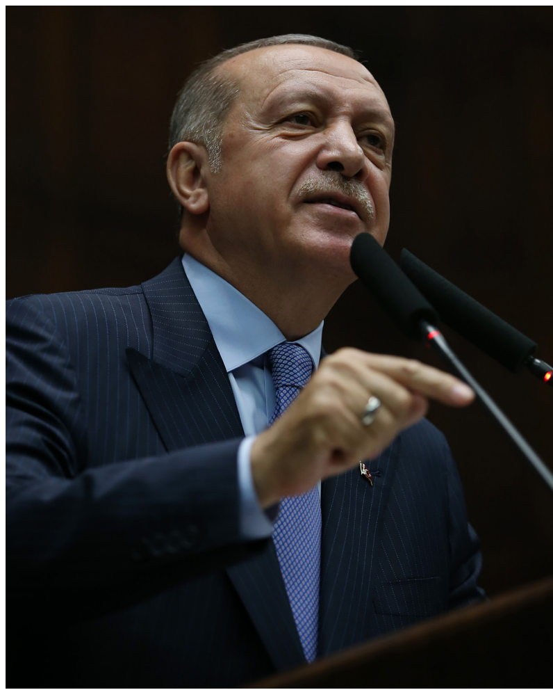
President of Turkey and the leader of the Justice and Development Party (AK Party) Recep Tayyip Erdogan