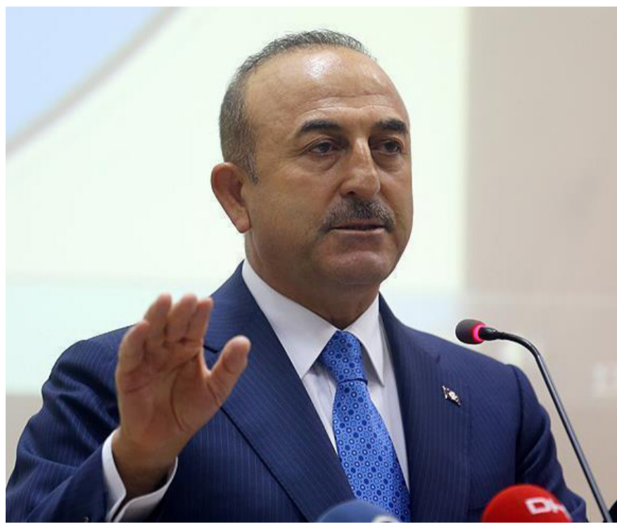
Turkish foreign minister Mevlut Cavusoglu

Turkish FM Cavusoglu says once Manbij model completed, similar model to be applied to other areas of Syria occupied by YPG