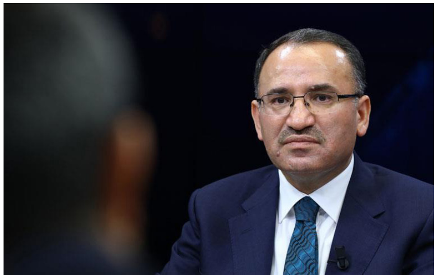
Turkish Deputy Prime Minister Bekir Bozdag

Gulen orchestrated the defeated coup on July 15, 2016 which left 250 people martyred and nearly 2,200 injured. Ankara also accuses FETO of being behind a long-running campaign to overthrow the state through the infiltration of Turkish institutions, particularly the military, police, and judiciary. MORE DETAILS