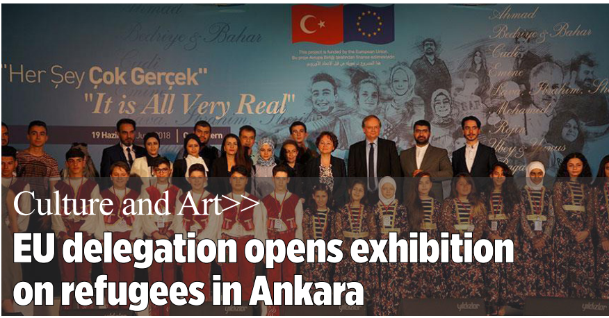
Culture and Art>> EU delegation opens exhibition on refugees in Ankara