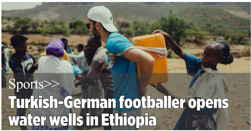
Sports>> Turkish-German footballer opens water wells in Ethiopia