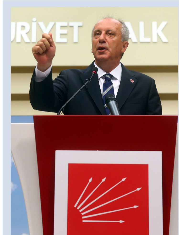
Former presidential candidate of main opposition party Muharrem Ince