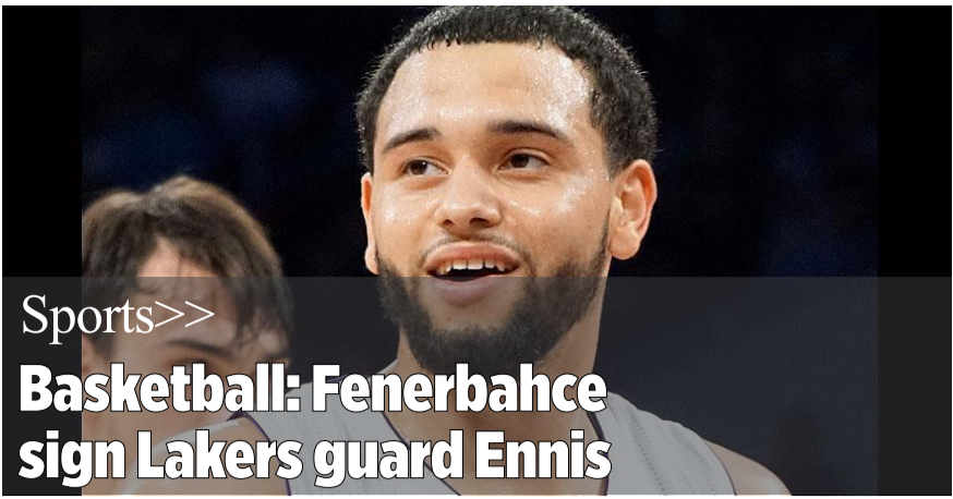
Sports>> Basketball: Fenerbahce sign Lakers guard Ennis