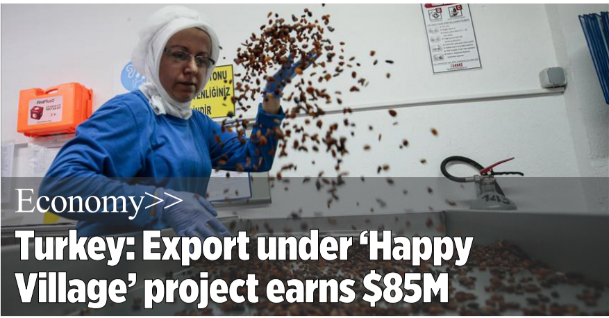
Economy>> Turkey: Export under 'Happy Village' project earns $85M