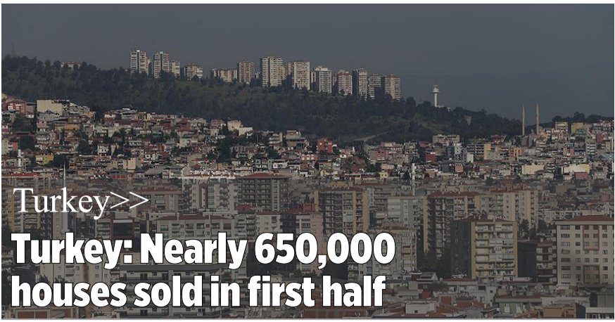
Turkey>> Turkey: Nearly 650,000 houses sold in first half