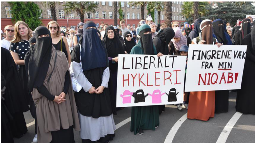
Anadolu Agency Photo