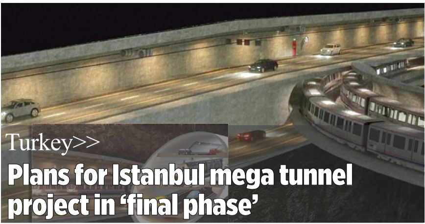
Turkey>> Plans for Istanbul mega tunnel project in ‘final phase’