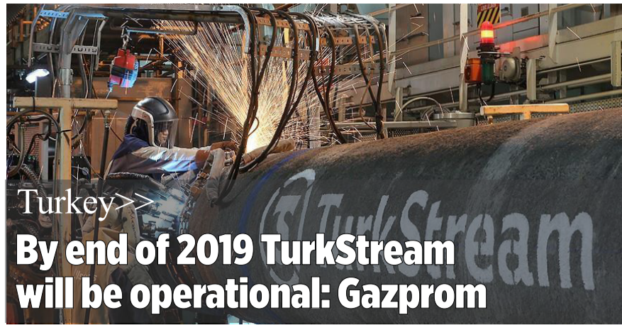
Turkey>> By end of 2019 TurkStream will be operational: Gazprom