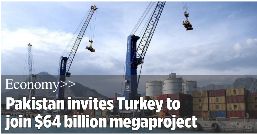
Economy>> Pakistan invites Turkey to join $64 billion megaproject