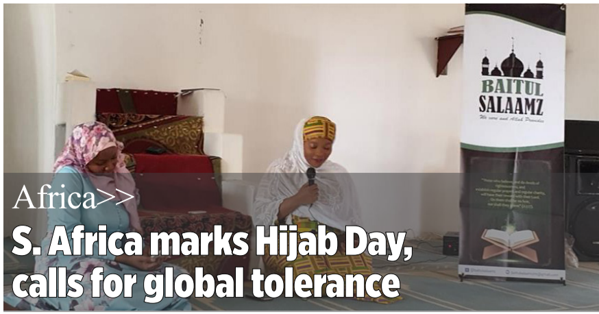
Africa>> S. Africa marks Hijab Day, calls for global tolerance