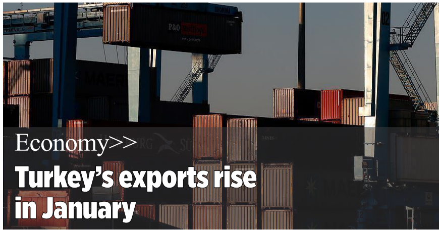
Economy>> Turkey's exports rise in January