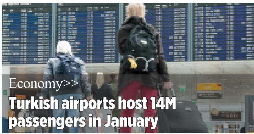
Economy >> Turkish airports host 14M passengers in January