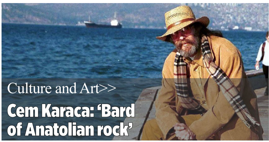
Culture and Art >> Cem Karaca: 'Bard of Anatolian rock'