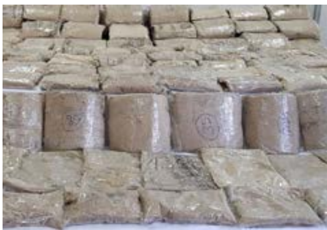
ANKARA - Nearly 5 tons of powdered marijuana were seized in international waters

6 suspects also arrested in operation conducted in Van province