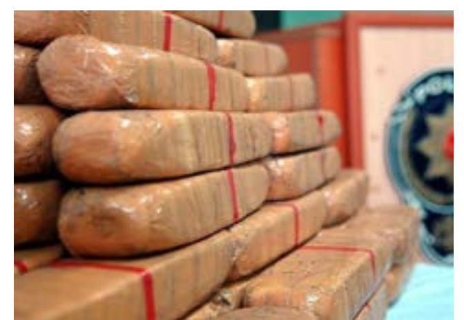
After the operation, two suspects were released under judicial control... MORE DETAILS

VAN, Turkey - Turkish security forces on Monday seized some 285.6 kilograms (629.5 pounds) of heroin in the eastern Van province, local police said. Acting on a tip off, anti-narcotic police teams carried out an operation at a cargo company in Tusba district and found 269 kg of heroin (593 pounds) in 515 packages hidden in toy boxes. Later, special police force carried out another operation in order to catch the suspects. Six suspect were arrested during the operation in a house in Akkpru neighborhood, where police teams also seized 16.6 kg of heroin (36.5 pounds) stuffed in 32 packages hidden in nutmeat.