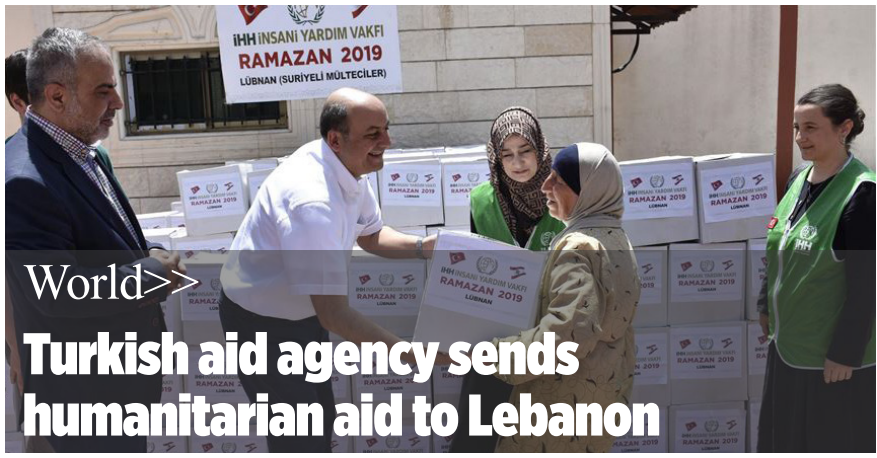
World>> Turkish aid agency sends humanitarian aid to Lebanon