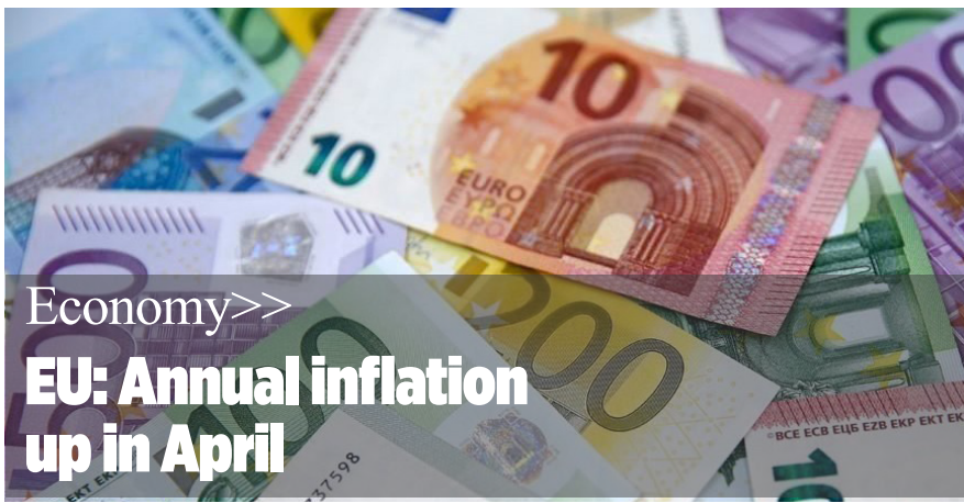
Economy>> EU: Annual inflation up in April