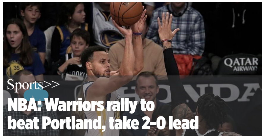
Sports>> NBA: Warriors rally to beat Portland, take 2-0 lead